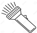
T _ _ C _ ,

Here are some items which should be there in your First Aid box. Name the things shown below and colour them: